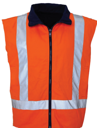
Orange & Reflective

*The UPF rating does not consider the design of this item in relation to recommended body coverage. Wear in combination with other sun protective clothing that has a UPF rating.