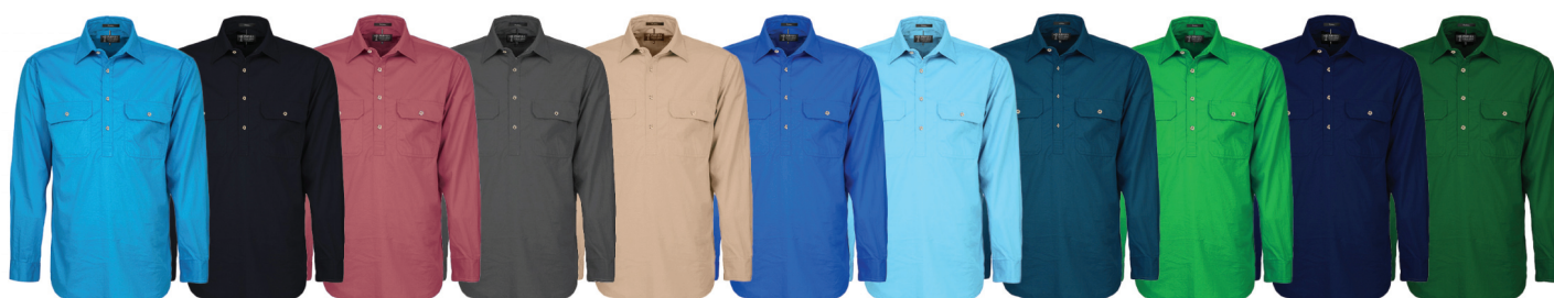
Azure Black Canyon Charcoal Clay Cobalt-Blue Cornflower Diesel Emerald French-Navy Green