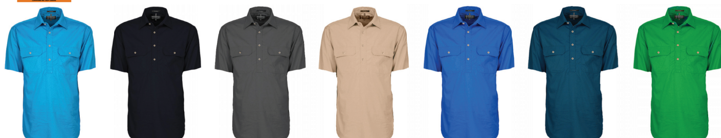
Azure Black Charcoal Clay Cobalt-Blue Diesel Emerald