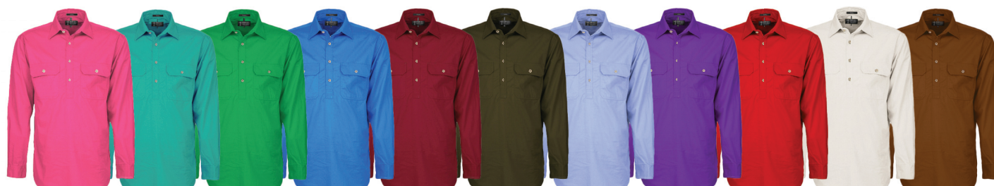
Hot-Pink Jade Kelly-Green Light-Blue Ochre Olive Pale-Blue Purple Red Stone Terracotta