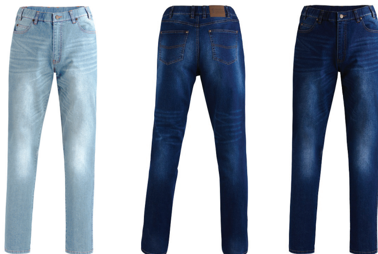
Acid Wash Denim