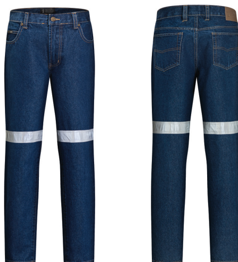
Stone Wash Blue Denim