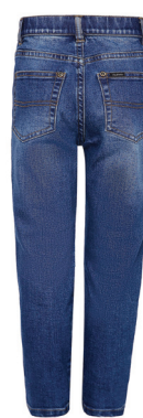
Weathered Blue Denim