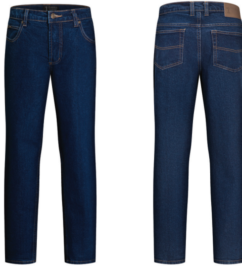
Stone Wash Blue Denim