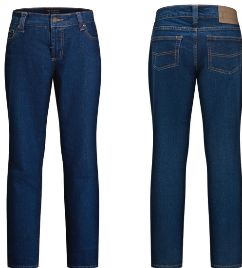
Stone Wash Blue Denim