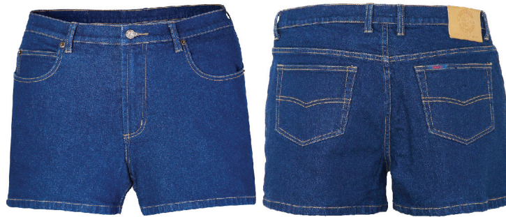
Stone Wash Blue Denim