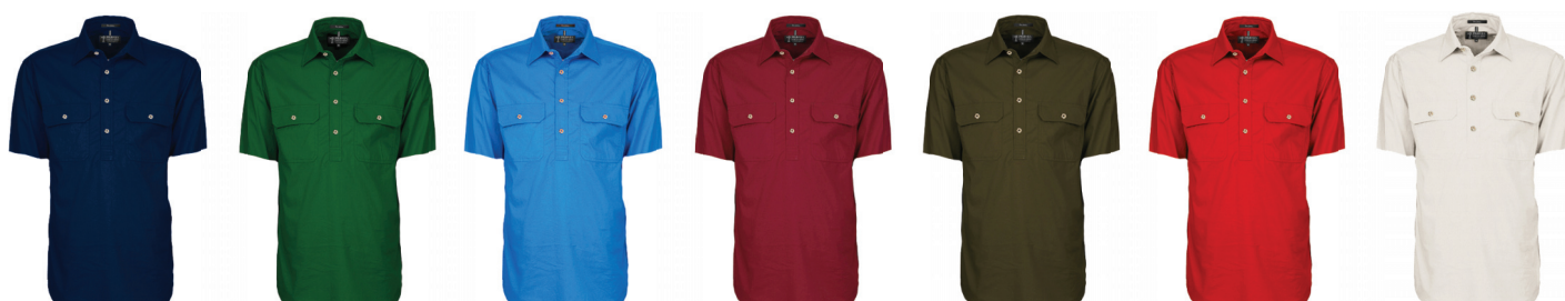
French-Navy Green Light-Blue Ochre Olive Red Stone