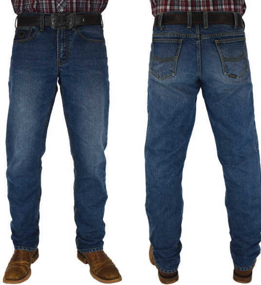
Angus Relaxed Straight Leg – Indigo