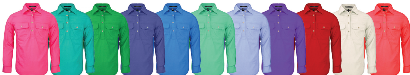
Hot-Pink Jade Kelly-Green Lavender Light-Blue Mint Pale-Blue Purple Red Stone Watermelon