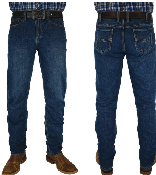
Brahman Slim Straight Leg – Indigo