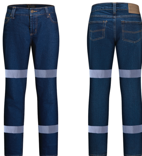
Stone Wash Blue Denim