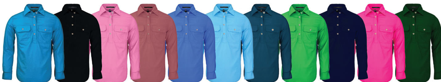
Azure Black Blush Canyon Cobalt-Blue Cornflower Diesel Emerald French-Navy Fuschia Green