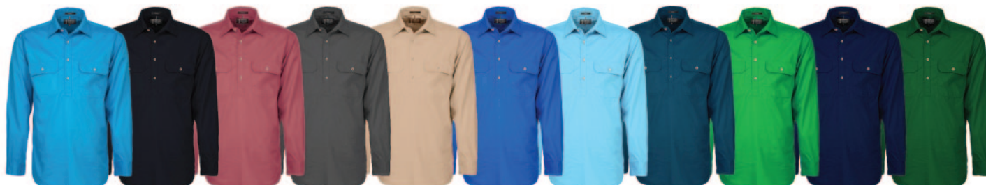
Azure Black Canyon Charcoal Clay Cobalt-Blue Cornflower Diesel Emerald French-Navy Green