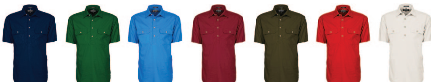
French-Navy Green Light-Blue Ochre Olive Red Stone