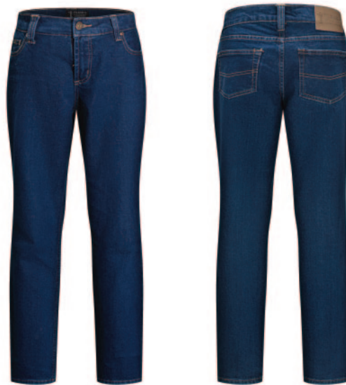
Stone Wash Blue Denim