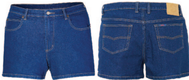
Stone Wash Blue Denim