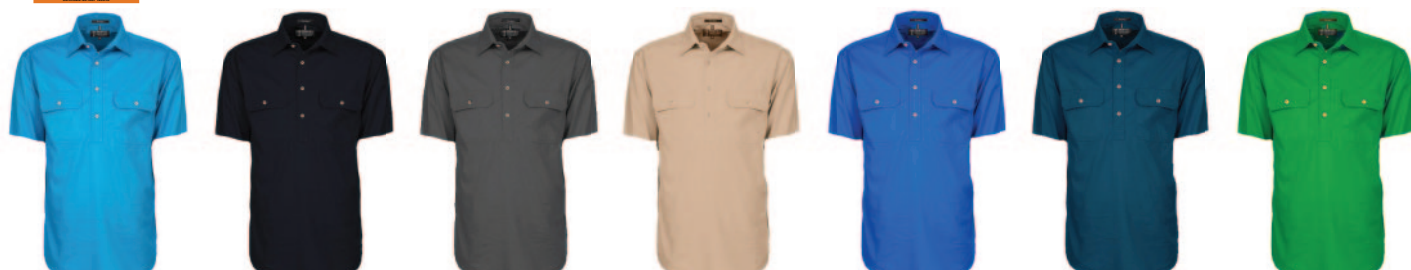
Azure Black Charcoal Clay Cobalt-Blue Diesel Emerald