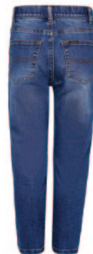
Weathered Blue Denim