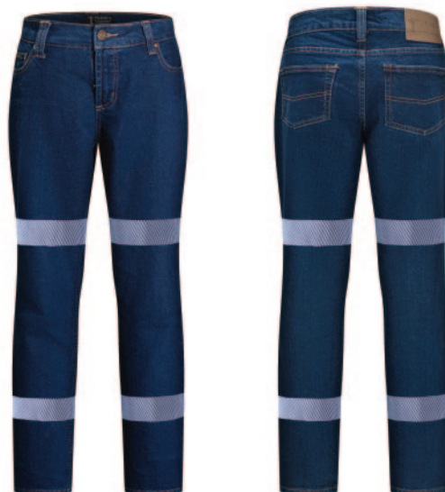
Stone Wash Blue Denim